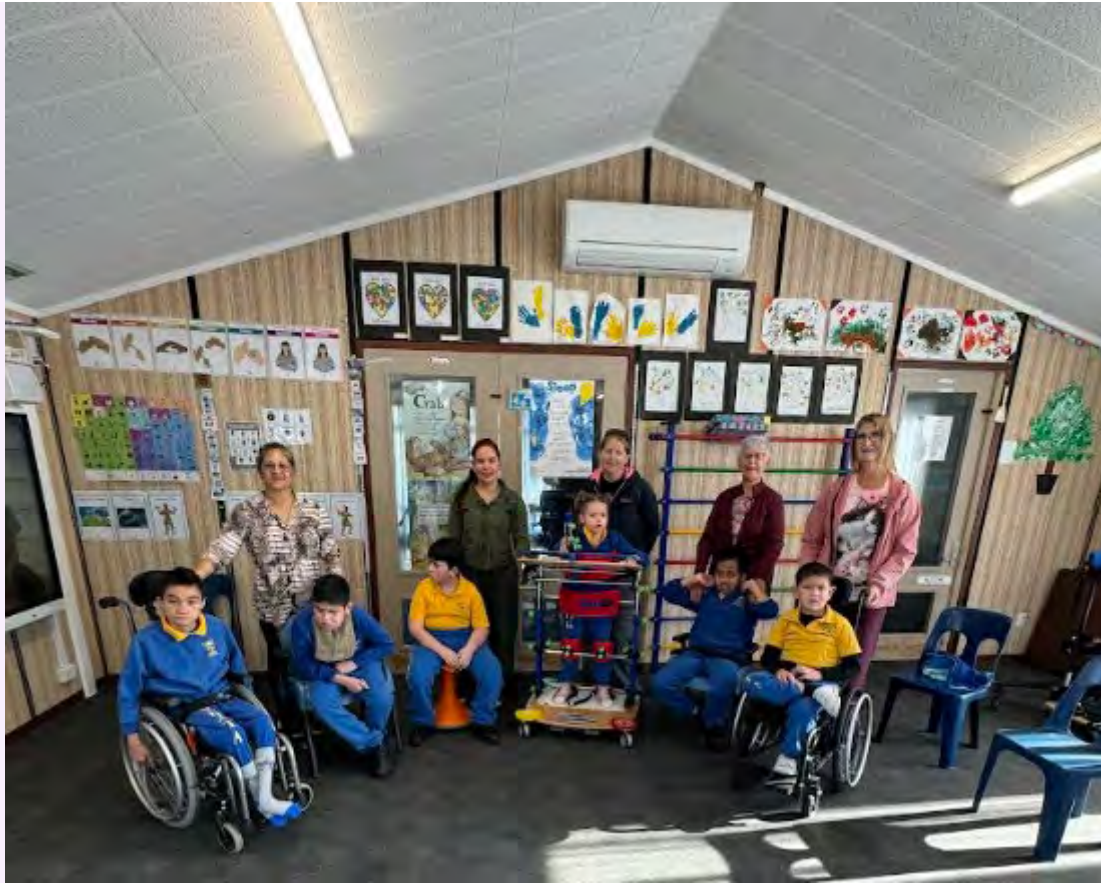
Featured Class this week - Owhata Satellite Class