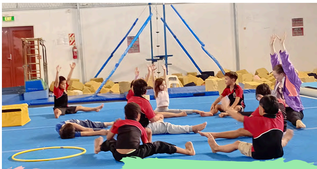
Gymnastics Taumatamahoe Room 1