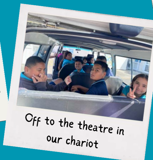
Off to the theatre in our chariot