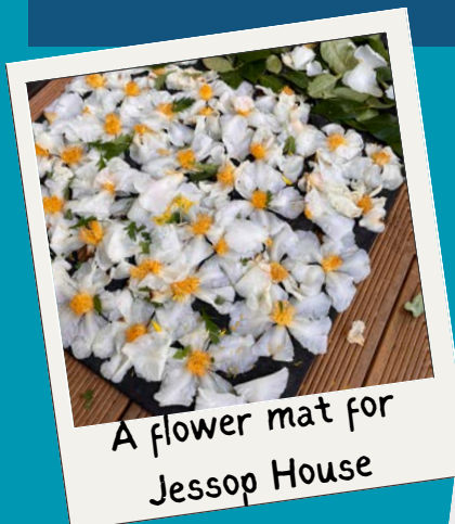
A flower mat for Jessop House