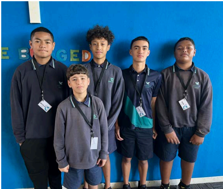
TUAKANA TEINA LEADERS